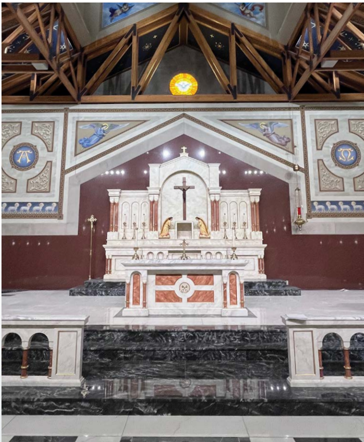
The Palm Sunday and Triduum liturgies were particularly special since we could celebrate them in the new church.