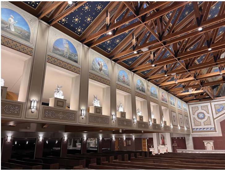
Construction was completed about a week before the dedication Mass on March 23 and we were able to return to our sanctuary for Palm Sunday and Triduum.