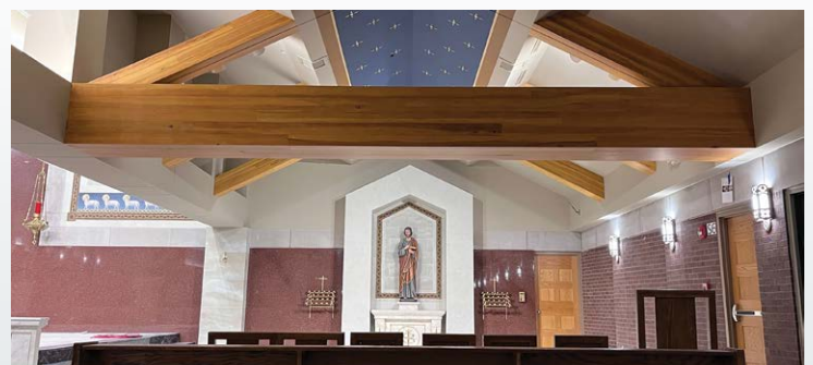
Many sacrifices were made to make these renovations possible. But these sacrifices mean that we have been able to celebrate our new church and its dedication.