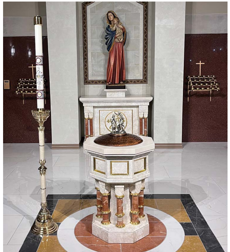
Aside from the beauty of the interior, many updates have been made as well.