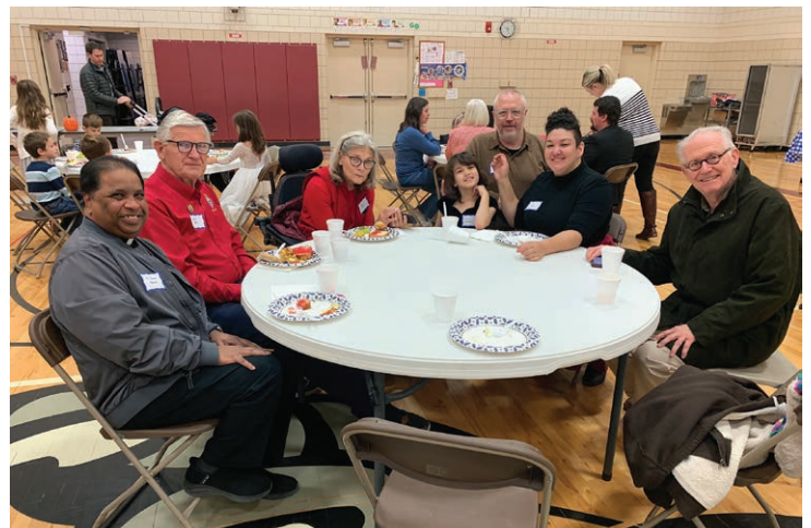
When new parishioners are intentionally welcomed, they are shown the beauty of our parish community.