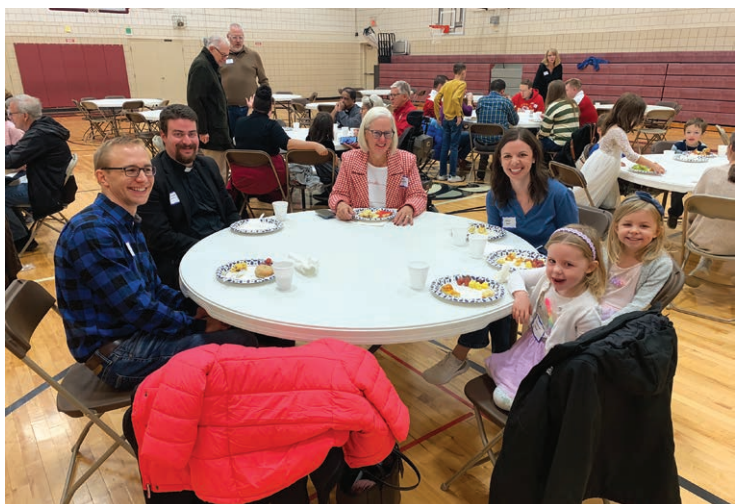
All parishioners can make people feel welcome — it’s a simple, but fulfilling task!