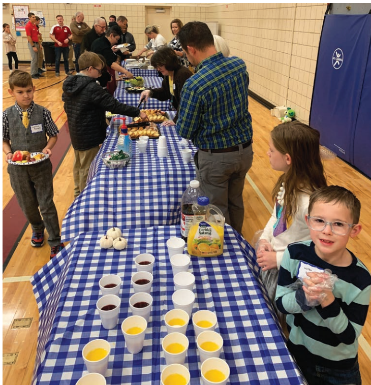
Join us as we welcome new parishioners to our faith community!