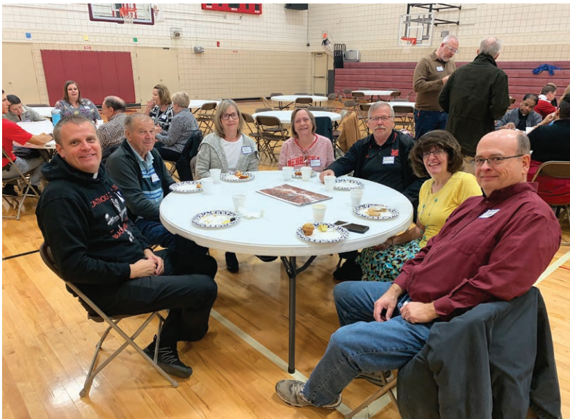
This ministry doesn’t just bless the new parishioners — it makes everyone feel good.