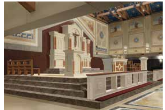
St. Peter Renderings